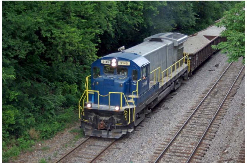
Fredonia Valley GE delivering gons of limestone to the P&L connection in Princeton, KY on July 6, 2007