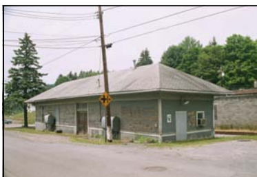
Depot At The End Of The World. Affectionately known as "the end of the world" in B&O Railroad times, the town of Cowen, WV, celebrates its railroad heritage every year. This is the extreme south end of the Appalachian & Ohio Railroad.