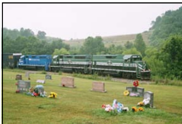
The southbound Appalachian & Ohio Buckhannon Local rolls into its namesake town of Buckhannon, WV, on July 6, 2007. Power for the train is a set of former Paducah & Louisville GP40-3/Road Mates and leased GMTX power.