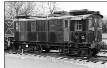
Box Cab Diesel at the Huntsville RR Museum