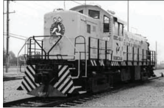
Alco RS-1 at Port of Huntsville