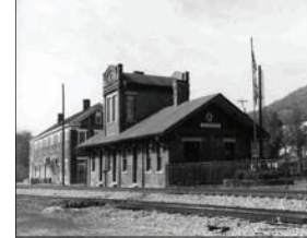
Station at Stevenson, AL