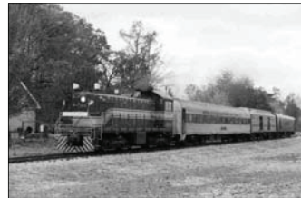
BOD Special on the former Memphis & Charleston, Huntsville